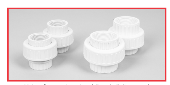
Union Connections (1-1/2" and 2" diameters)

E3T pool and spa heaters are compact, come standard with union connections, and are easy to install. They are the perfect solution for a new pool or spa, as well as to replace any existing pool or spa heater. Available in 5.5, 11, 18 and 27 kW.